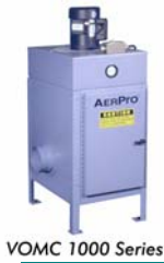
VOMC 1000 Series