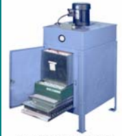
VOMC 1000 Series

GEAR CUTTERS – PARTS WASHERS – SCREW MACHINES