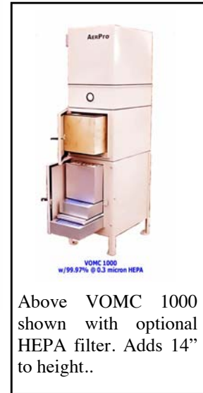
Above VOMC 1000 shown with optional HEPA filter. Adds 14" to height..

Unless specified, the unit will ship with the inlet on the left hand side. Unit has right hand cover plates for switching inlets. Unit is pre-wired for 460/230/3/60. Unit weighs 229#’s.