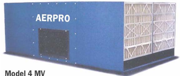
Model 4 MV

The air cleaning begins with the air entering through the four 4" multivee disposable prefilters and continuing through the 95% efficiency rated micro glass main filters. The "T" shape air flow allows for very effective cross flow room patterns.